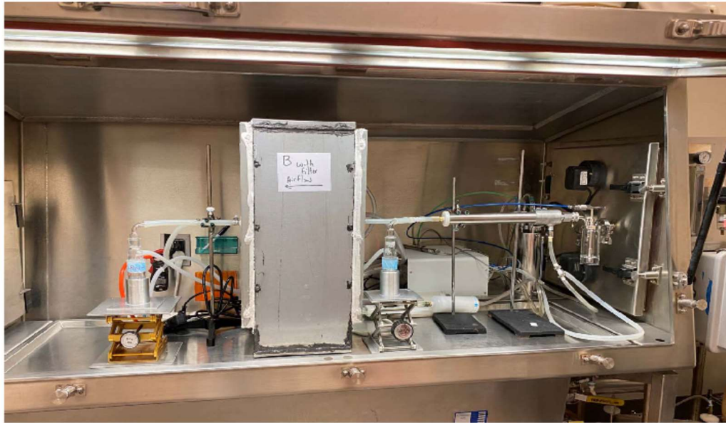
Figure 1. Laboratory hood set up with aerosolization and detection equipment and the Genesis Air technology.

was 0.31 log TCID50/ml (less than half of one log reduction). For sprays 4-6 (Genesis Air panel on/no filter), there was a significant reduction in active virus between Biosampler 1 and 2, with significantly less viable virus detected after the aerosol passed through the Genesis Air panel, p=0.0453 , and a 1.55 log TCID50/ml reduction. For sprays 7-9 (Genesis Air on with MERV 13 filter) there was also a statistically significant reduction in viable virus from Biosampler 1 to 2, p=0.0195 , bringing the viable virus detection below the lower limit of detection (LLOD) with an average log reduction TCID50/ml greater than or equal to 3.37.